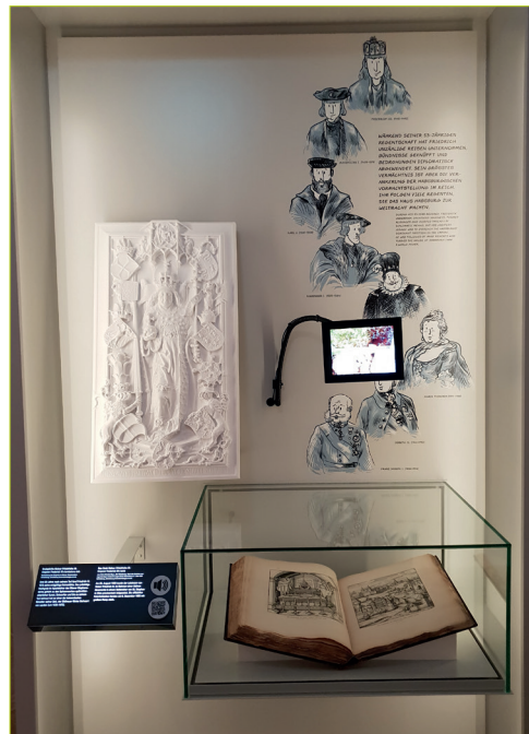
↑ The tactile relief of Emperor Frederick III's tombstone slab is on exhibition at the Niederösterreichische Landesausstellung 2019.