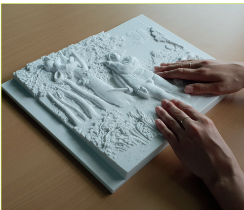
↑ Tactile relief of "Der Vogeldieb" custom-built for Kunsthistorisches Museum Wien.